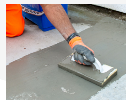
Brush apply tuffbond to the base* and to the underside of the paving units